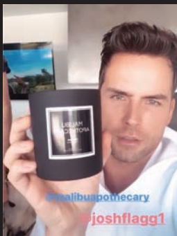
@Bboydla Million Dollar Listing Followers: 40.6K