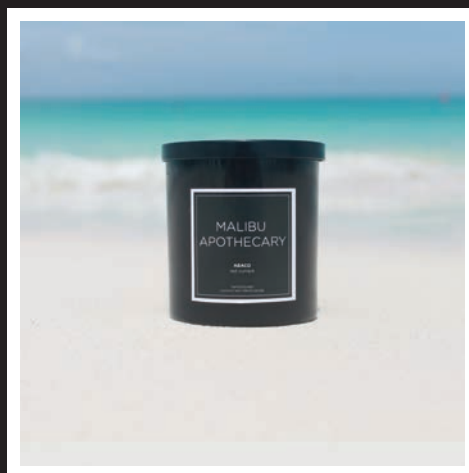
HIGH GLOSS | 8 OZ