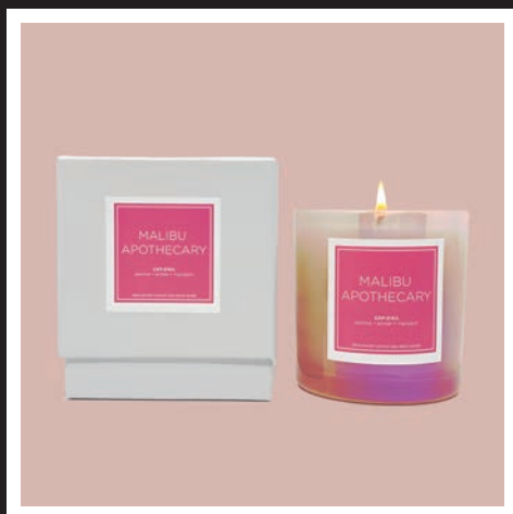
IRIDESCENT PINK | 8 OZ 20% OF ALL ONLINE SALES GO TO THE BCRF