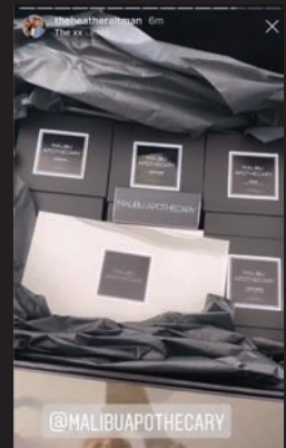
@theHeatherAltman Million Dollar Listing Followers: 331K