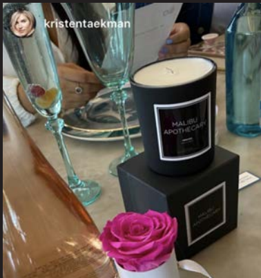
@KristenTaekman Real Housewives of NY Followers: 265K

CLEAN | CHIC | CALIFORNIA CRAFTED | CANDLES