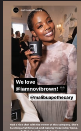
@IAmNoviBrown Followers: 53.8K