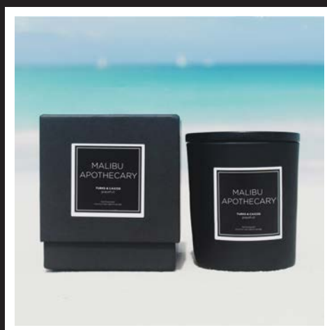
CLASSIC MATTE | 8 OZ 20% OF ALL ONLINE SALES GO TO HEAL THE BAY