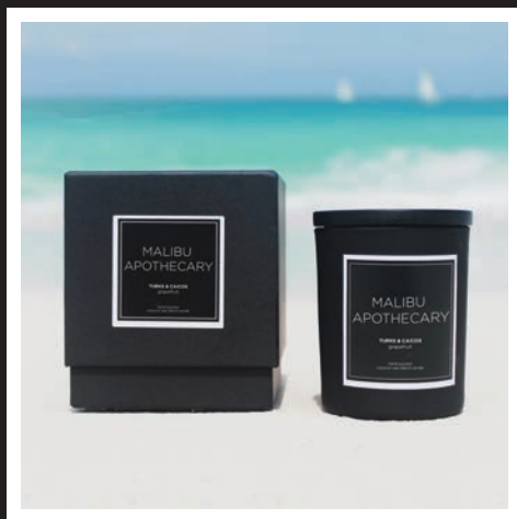
MATTE MINI | 4 OZ 20% OF ALL ONLINE SALES GO TO HEAL THE BAY

contact: CLAIRE ELLIS | claire@malibuapothecary.com | 972.757.1812 | MALIBUAPOTHECARY.COM