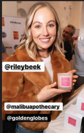
@RileyBeek Followers: 160K