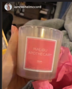
@IAmRachelMcCord Followers: 458K

"Beautiful products" Fran Berger, Lifestyle Influencer