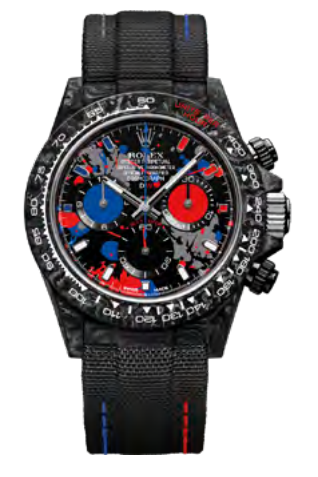
MOTLEY 3S SERIES 57990 €