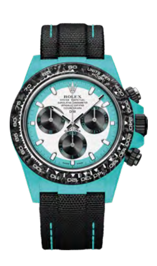
CELESTE INVERT 59990 €