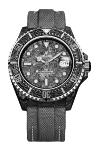
STONE GRAY 44990 €