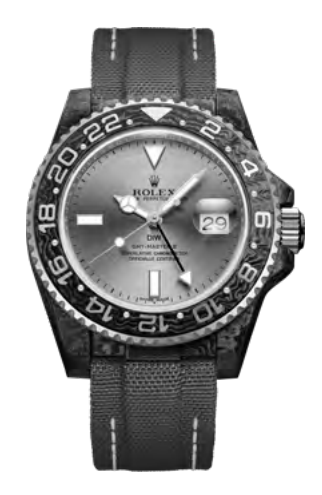
SILVER C 44990 €