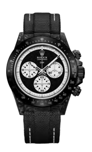
PN BLACK DLC 54990 €