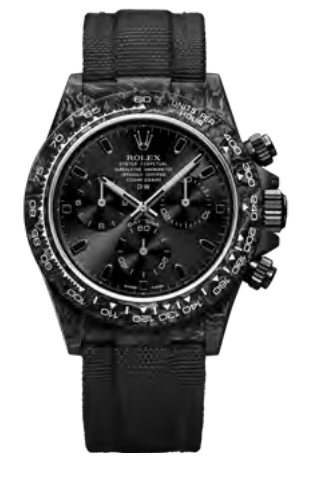
ALL BLACK 54990 €