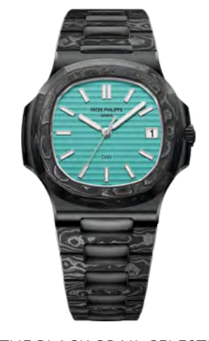
THE BLACK GRAIL CELESTE 179990 €