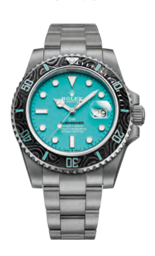
AQUAMARINE 34990 €