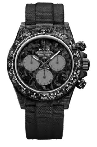
GRAPHITE 56990 €