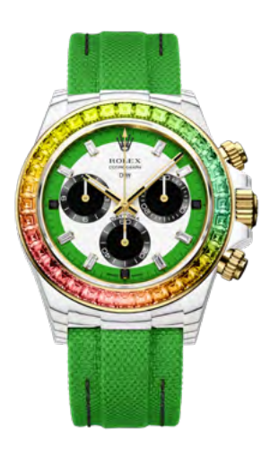
RAINBOW WILD GREEN 76990 €