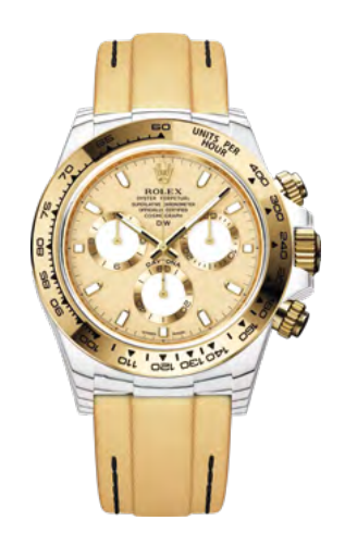
GOLDEN ESSENCE 59990 €