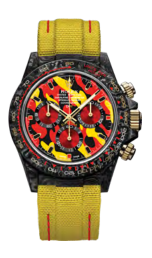
MILITARY YELLOW 58990 €