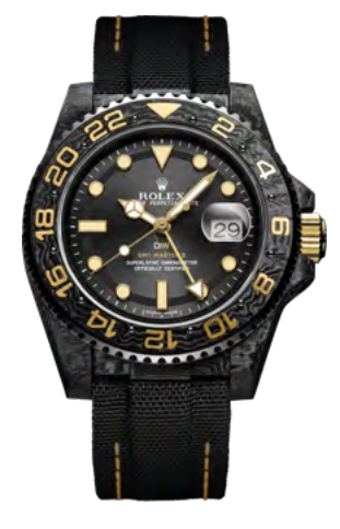
GOLDEN C 45990 €