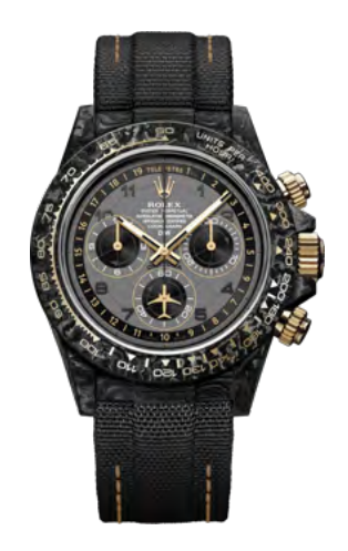
AVIA GREY 56990 €