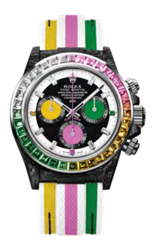
RAINBOW CANDY 78990 €