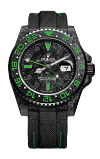
STINGER 41490 €