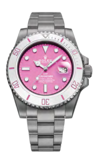
FUCHSIA 35990 €