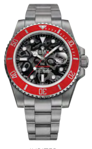
JUPITER 35990 €