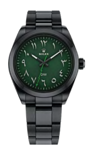
DLC BLACK&DIAL GREEN 26490 €