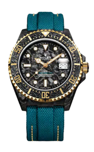
TURQUOISE 47990 €