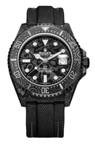
ALL BLACK 43990 €