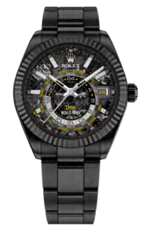
BLACK CARBON YELLOW 48990 €