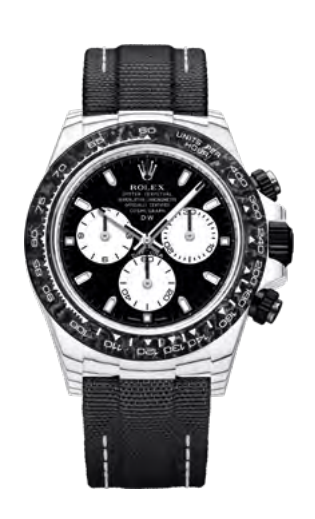
IRBIS V2 62990 €