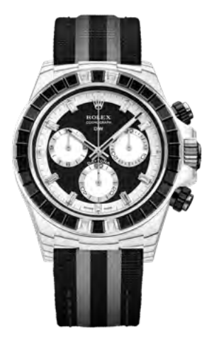
SPORT BLACK €