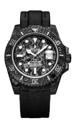
ALL BLACK 42990 €