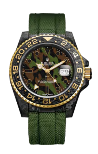
MILITARY 45490 €