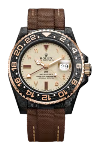
DESERT EAGLE EVEROSE 50490 €