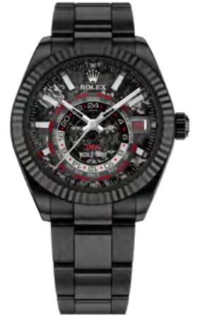
BLACK CARBON RED 48990 €