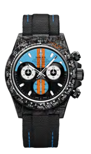
GT BLUE 55990 €