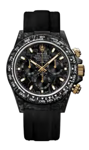
BLACK&GOLD 56990 €