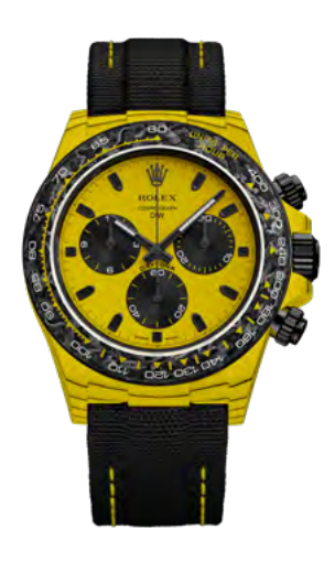
BUMBLEBEE 61990 €