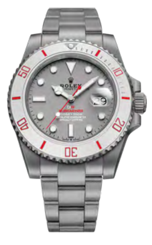
GLACIAL 35990 €