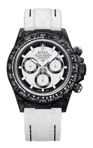
CREAM V2 55990 €