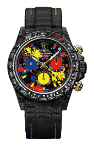
MOTLEY 3D SERIES 58990 €