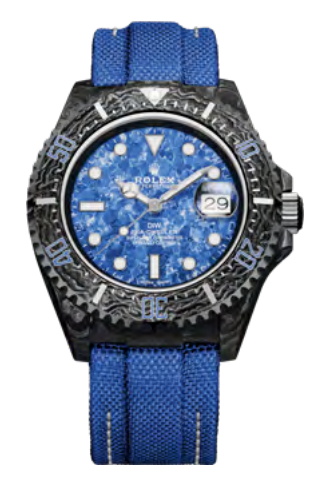
OCEAN BLUE 44990 €