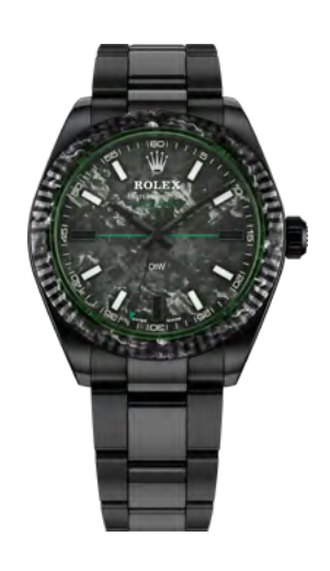
AVIATOR 26490 €