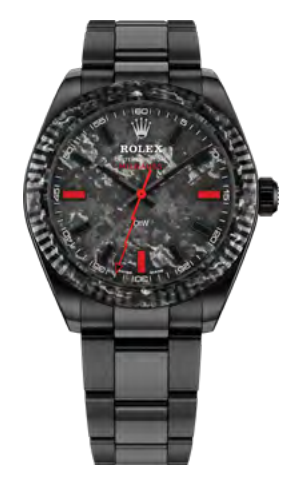
SPEEDSTER 25490 €