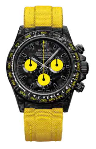
LEMON EDITION 54990 €