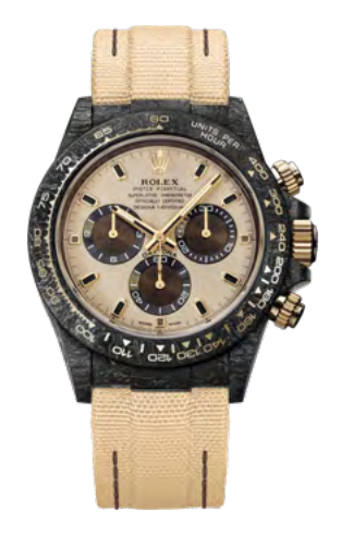
DESERT EAGLE 55990 €