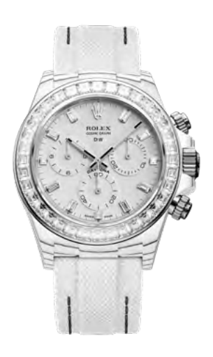
CRYSTAL 87990 €