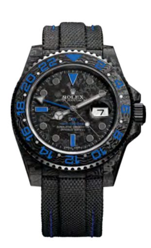
ELECTRO 41490 €