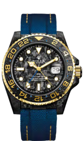
GOLDEN SAIL 45990 €