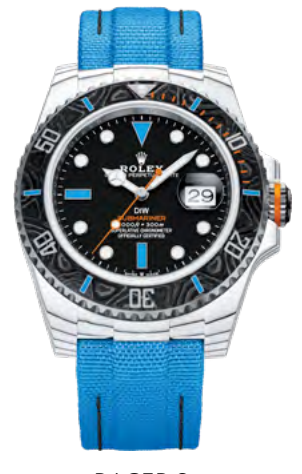
RACER S 48990 €