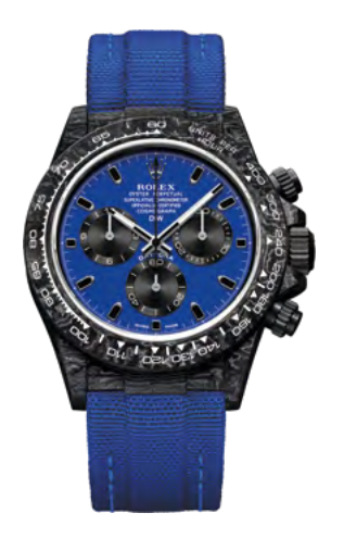
MIAMI BLUE 54990 €