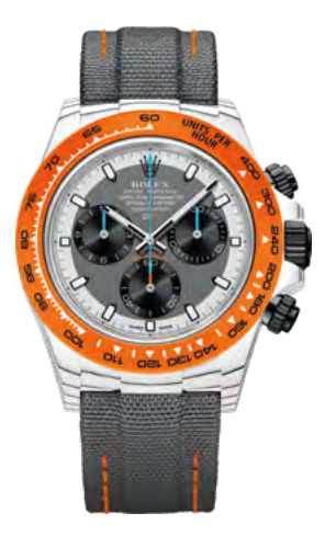
OCELLARIS 61990 €