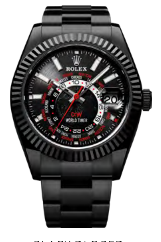
BLACK DLC RED 44990 €