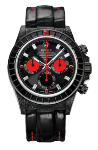
RAINBOW BLACK 74590 €