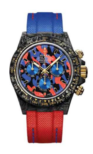
MILITARY RED 58990 €