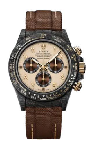
DESERT EAGLE ARABIC 55990 €