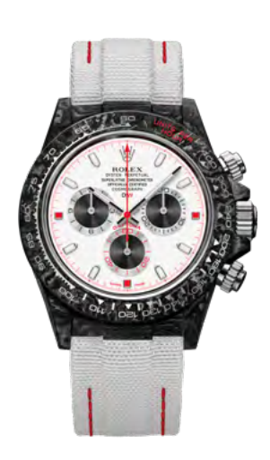
SPEEDSTER WHITE 54990 €