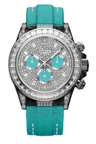
ARTISTIC-1 84990 €