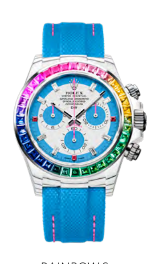
RAINBOW S 76990 €