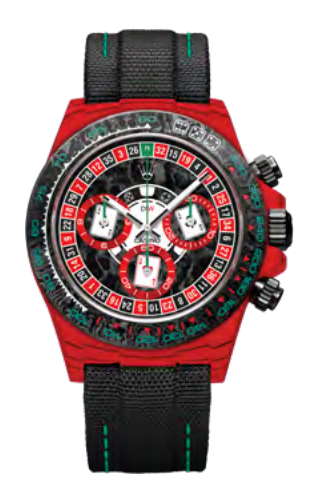
LUCKY PLAYER V3 59990 €