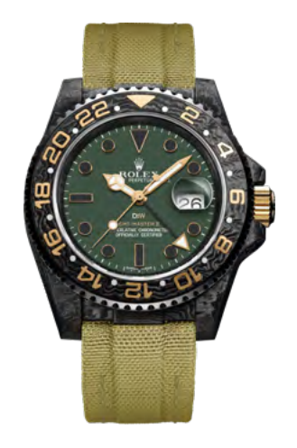
DESERT CAMO 45490 €