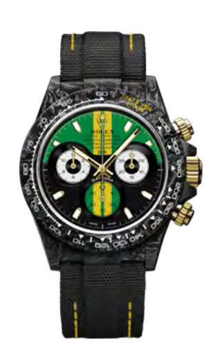
GT GREEN 56990 €