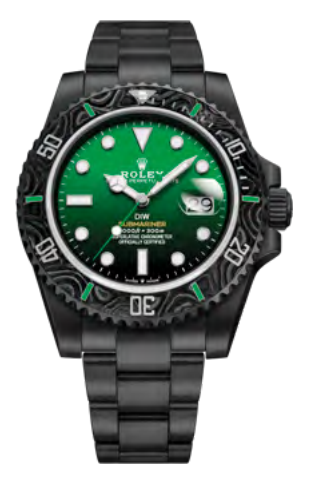
PARAKEET 36990 €