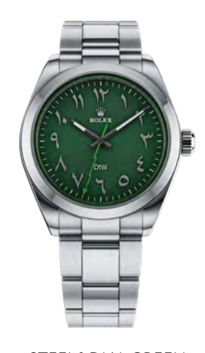
STEEL&DIAL GREEN 25490 €