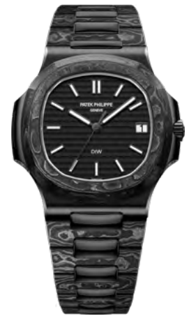
THE BLACK GRAIL 179990 €