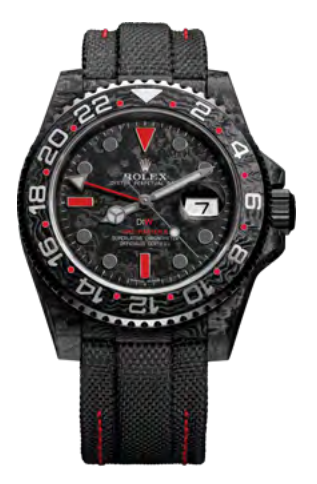
SPEEDSTER 41490 €