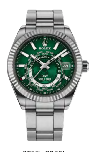
STEEL GREEN 42990 €