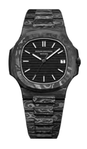
ALL CARBON BLACK 184990 €