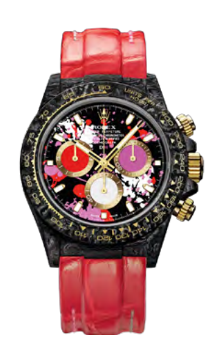
MOTLEY RED 59990 €