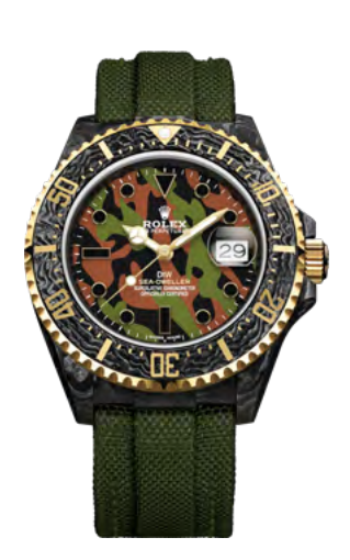
MILITARY 47990 €