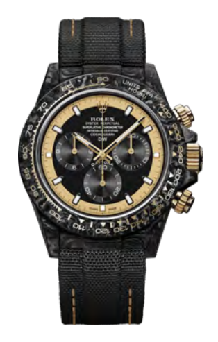
CREAM INVERT GOLD 55990 €