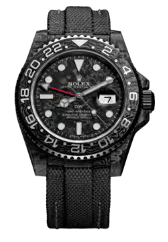
ALL BLACK 41490 €