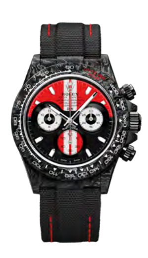
GT RED 55990 €