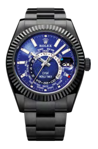
BLACK DLC BLUE 44990 €