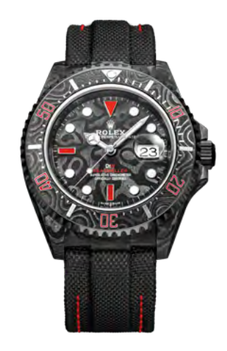
SPEEDSTER 43990 €