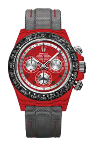
AVIA RED 60990 €