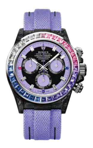
RAINBOW VIOLET 78990 €