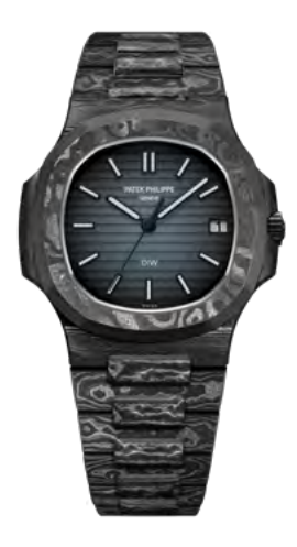
ALL CARBON GRIS 184990 €