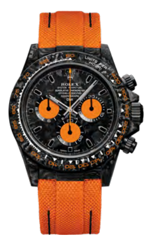
ORANGE EDITION 54990 €