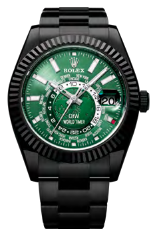
BLACK DLC GREEN 44990 €