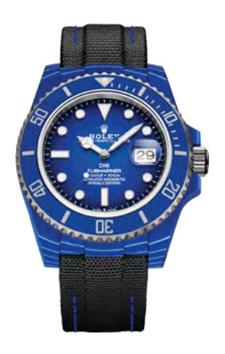
DEEP BLUE 48990 €