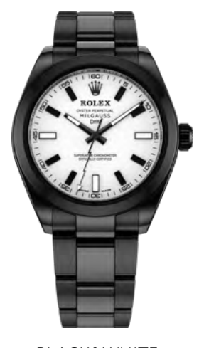
BLACK&WHITE 25490 €