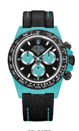
CELESTE 59990 €