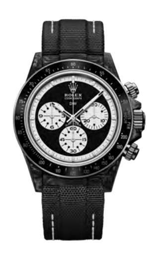
PN BLACK SC 54990 €