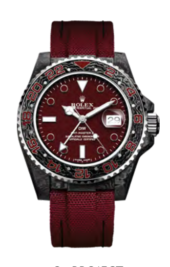
«Q» PROJECT 41490 €