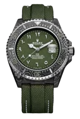
HUNTER ARABIC 43990 €