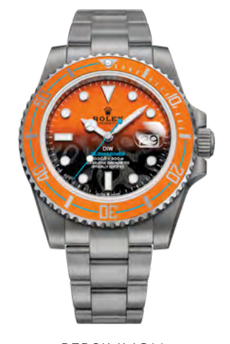
PERSIMMON 36990 €