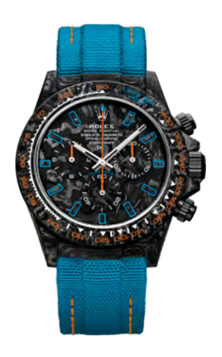
TROPICAL 56990 €