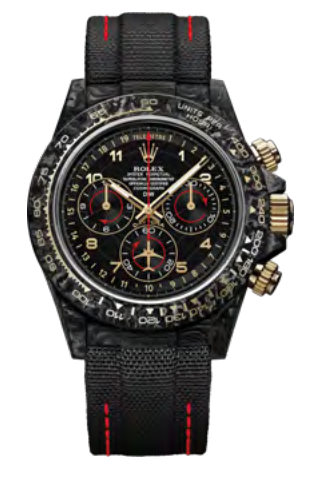
AVIA BLACK 56990 €