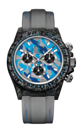
MILITARY BLUE 55990 €