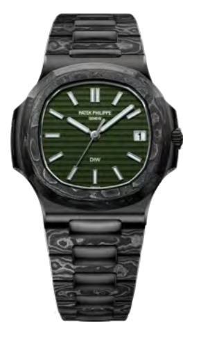
THE BLACK GRAIL KHAKI 179990 €